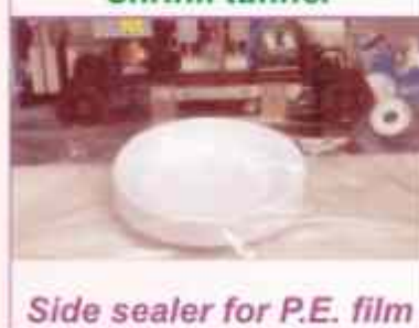
Side sealer for P.E. film