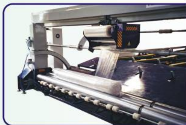
Machine for 5.5M Rolls