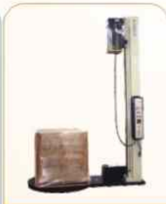
Pallet Wrapper - 4 meter Mast