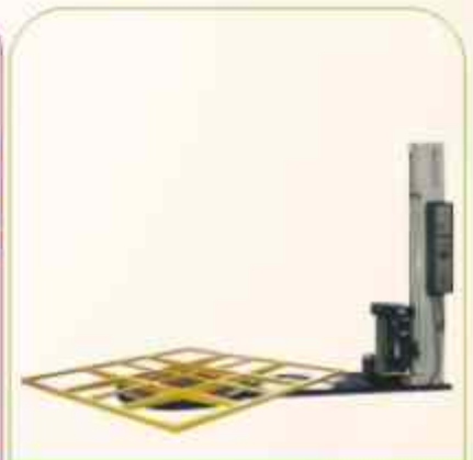
Pallet Wrapper - 4 Meter Turn table