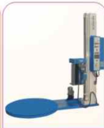
Pallet Wrapper - PLC Control