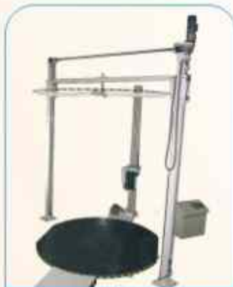
Pallet Wrapper - 3.2 meter Turn table